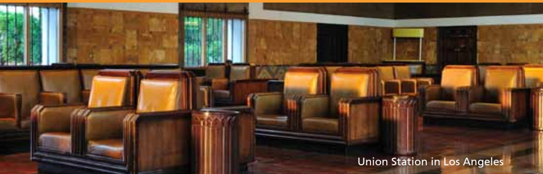
Union Station in Los Angeles