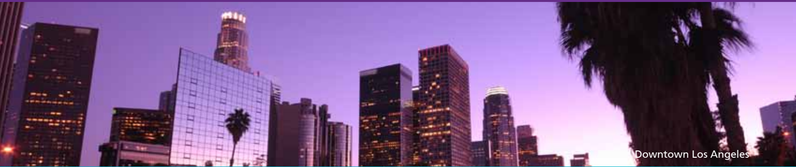
Downtown Los Angeles