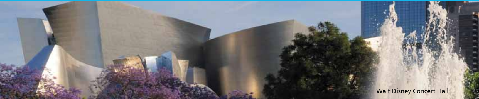
Walt Disney Concert Hall