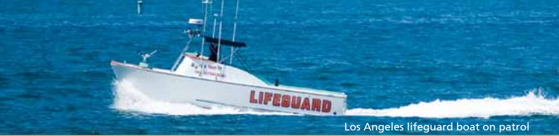
Los Angeles lifeguard boat on patrol