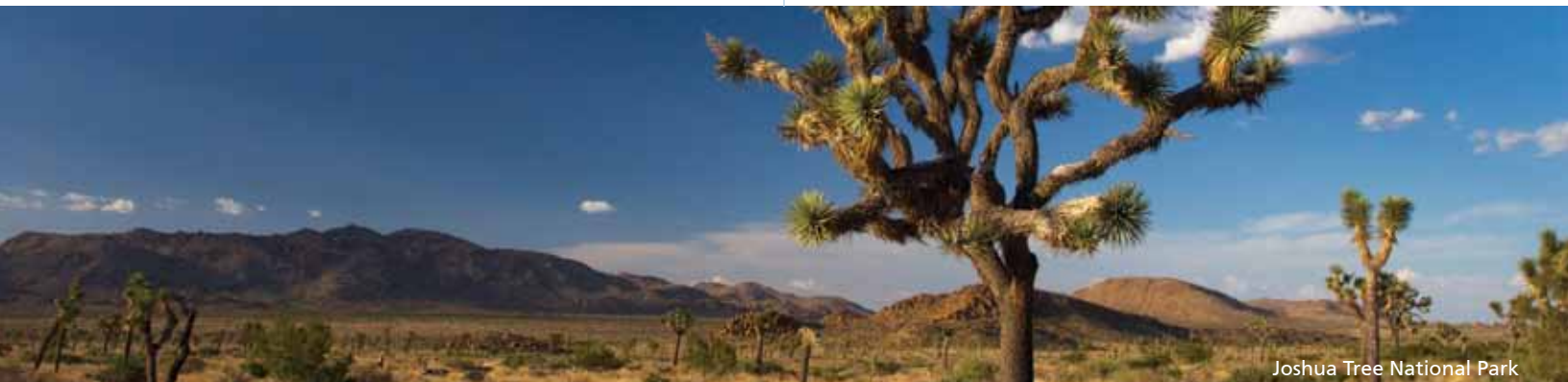
Joshua Tree National Park

In late March, you may view the fund data booklet online by visiting the Savings Plan website at www.countyla.com . Click on the "Fund Options" tab and then on the "Fund Data Sheets" link. If you'd like to receive a hard-copy booklet, you can call the County of Los Angeles Service Center in late March at (800) 947-0845 to request one.